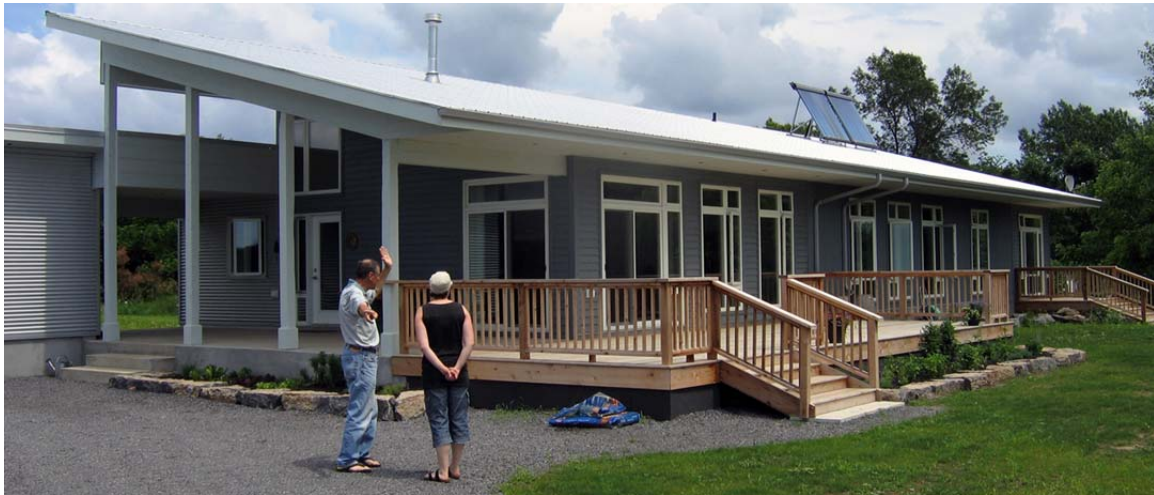
Country Trail House Exterior - Actual Photo