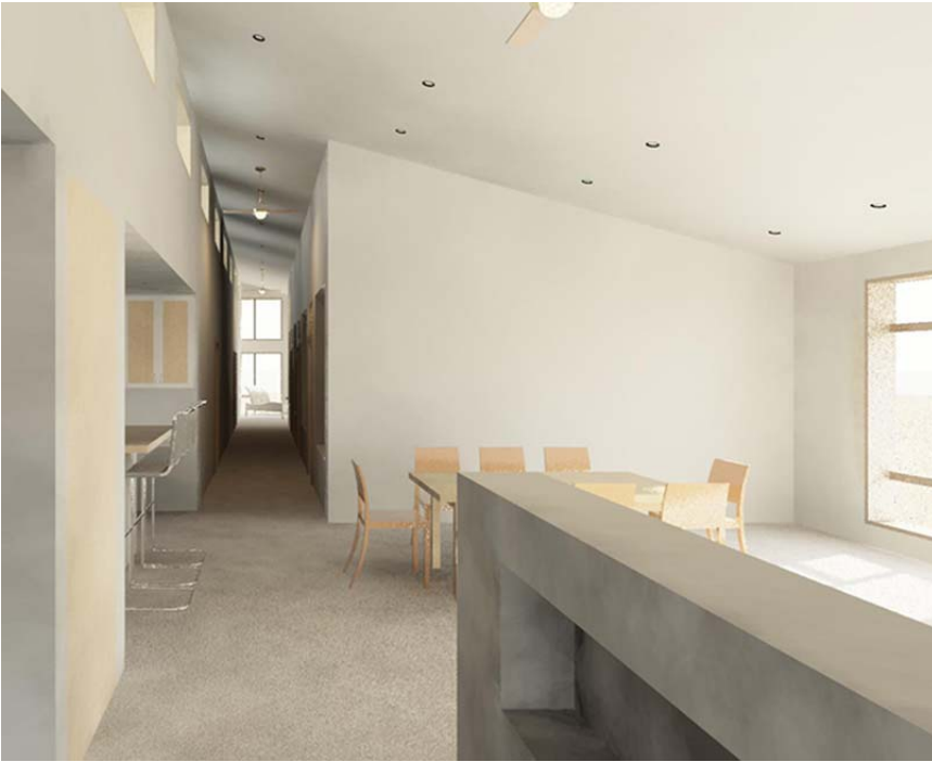
Country Trail House Interior - Revit Architecture Rendering